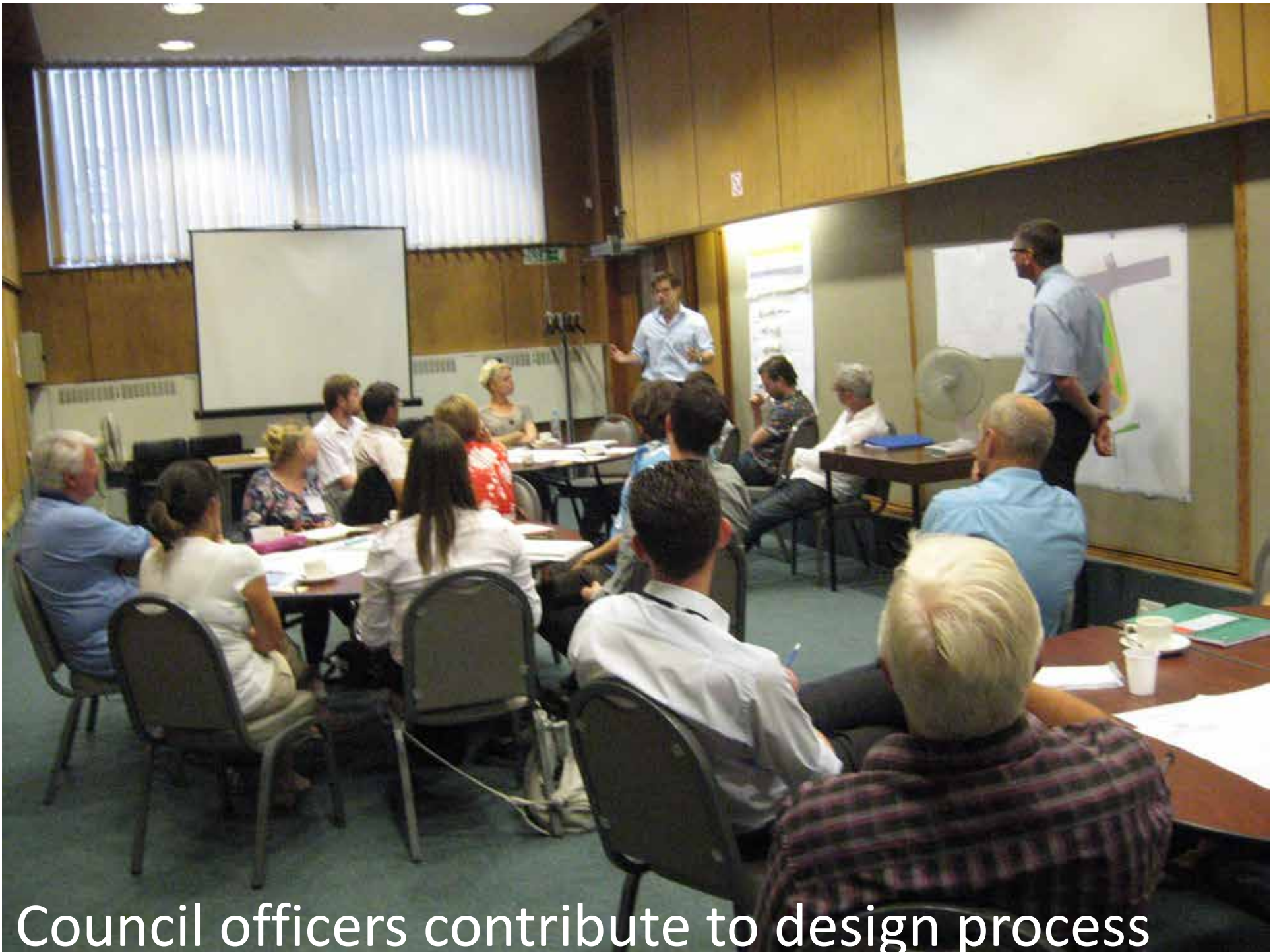
Council officers contribute to design process