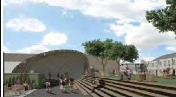
Providence Place Street View (Left) - Westward Facing View