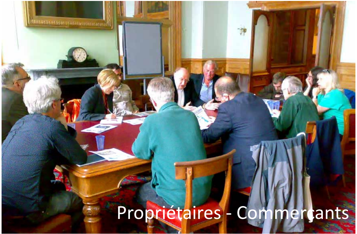
Propriétaires - Commerçants